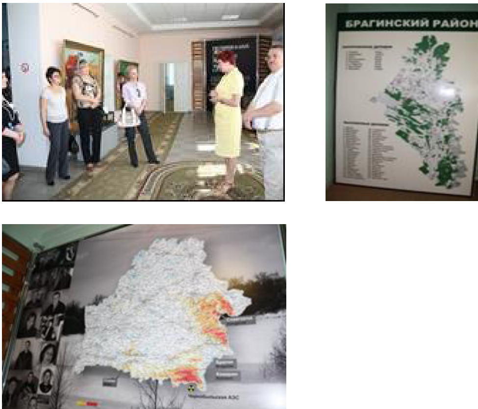
Figure 2. Visit to Bragin Historical Museum with Art Gallery – Chernobyl theme.

The visit to the museum where exhibitions presented the theme of Chernobyl and the history of Bragin (Figure 2), and the film presenting the Chernobyl catastrophe and life after it were very touching, and the experiences presented by the eyewitnesses and real stakeholders of the consequences remain in the minds of all.