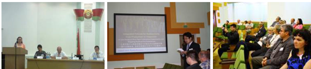
Figure 3. International Scientific Conference “Nuclear and radiation safety: Lessons from Chernobyl and Fukushima”.