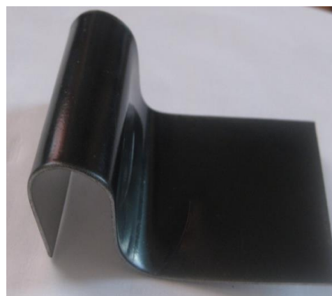
Figure 2. Image of the aluminium plates with decorative films base silica dioxide