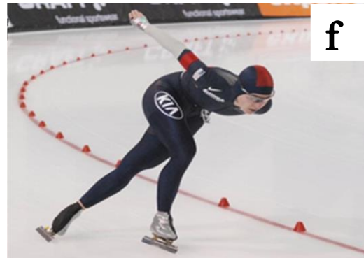
Figure 2 – Events