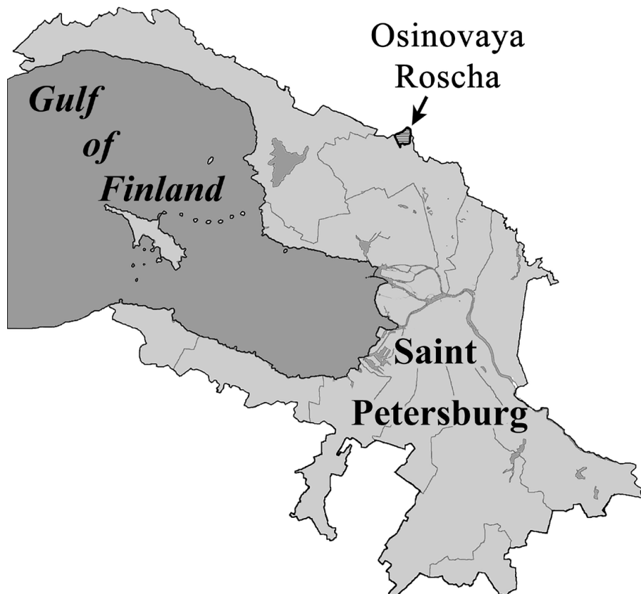
Fig. 1. The location of the study area in the limits of St. Petersburg.

is partly occupied by horse riding club, former military buildings, and private gardens. The proposed protected territory Osinovaya Roscha is restricted by Vyborgskoe and Priozerskoe highways and the border of the Leningrad Region and has a total area of 1.9 km 2 (Fig. 2).