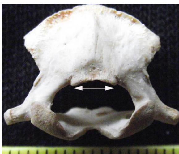
Fig. 2. Deposition of calcium salts in the foramen magnum